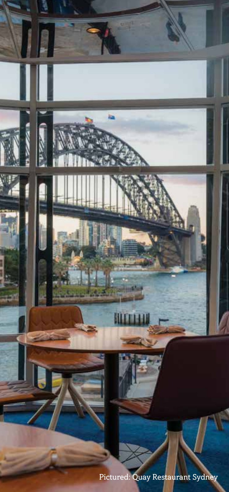
Pictured: Quay Restaurant Sydney