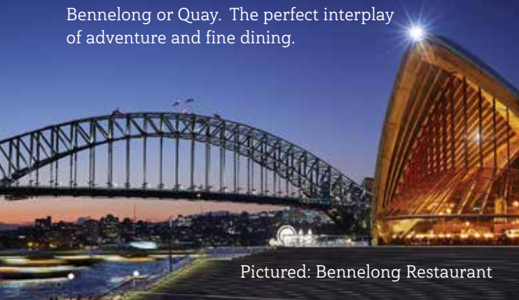
Pictured: Bennelong Restaurant

Designed for couples and groups up to 80, this perfectly matched partnership allows guests to climb the iconic Sydney Harbour Bridge and dine overlooking the glistening Sydney Harbour from the best seat in the house at Bennelong or Quay. The perfect interplay of adventure and fine dining.