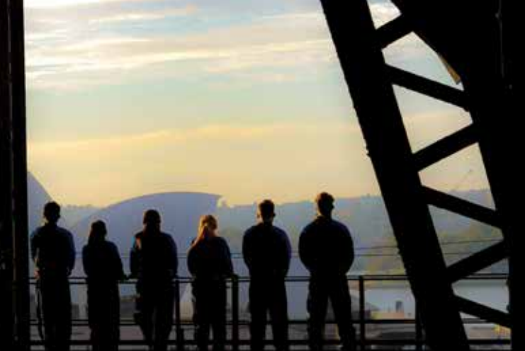
Pictured: BridgeClimb Sydney